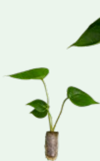
Plug - SP1 Plant height: 7-12 cm

With these product types, a suitable type can be found for every market and customer.