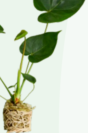
9cm pot - 201 Plant height: 17-25 cm