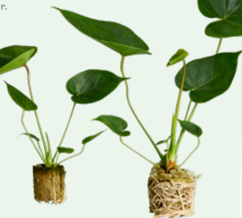
Plug - 6SP1 Plant height: 10-20 cm